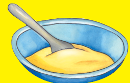
1/2 cup custard

*It is recommended that milk is offered at both morning and afternoon tea