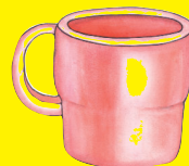
1/2 cup (100ml) milk