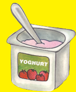
1/2 small tub (1/3 cup) yoghurt